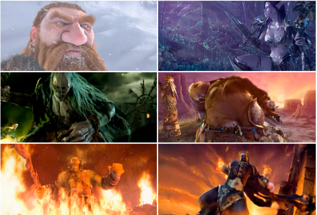
Figure 3: Introductory Video Screenshots